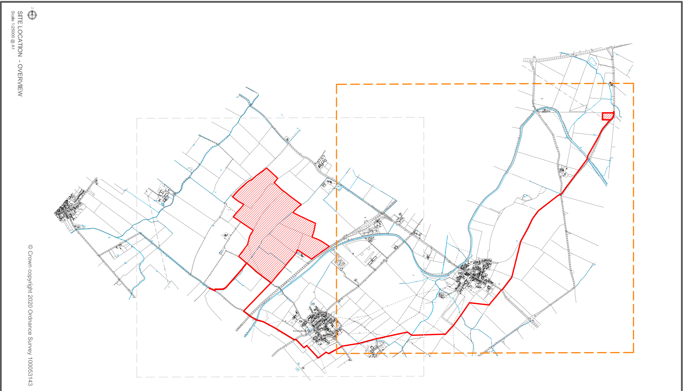
SITE LOCATION - OVERVIEW Scale: 1:25000 @ A1